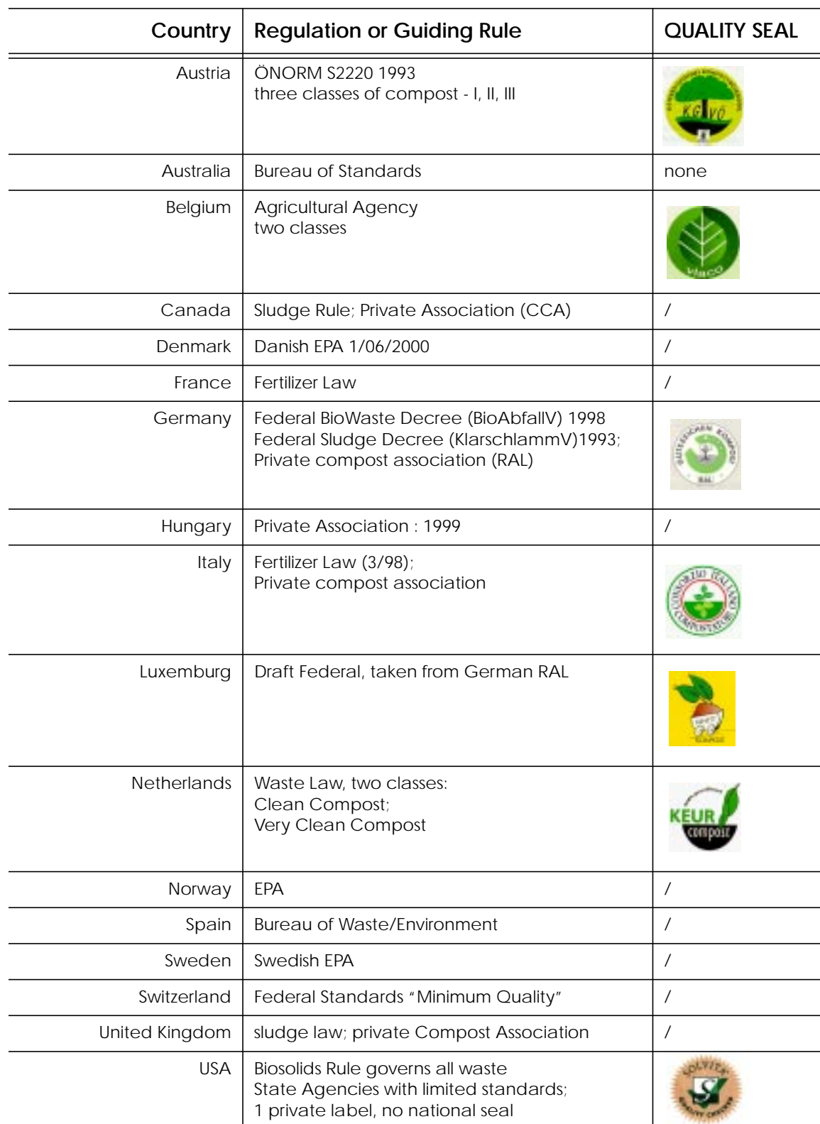
Table 2: Status of Compost Quality Seals by Country (Modified, after Centemero, 1999)